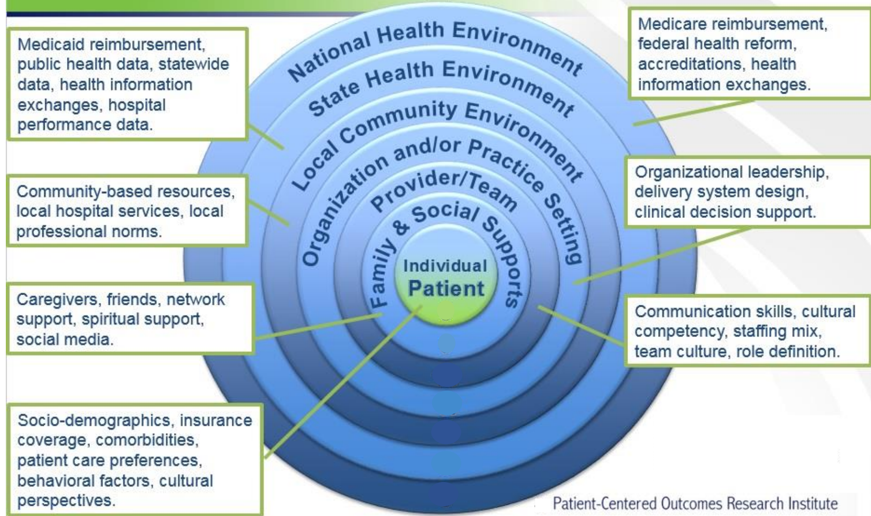
Figure adapted from: Taplin, S. H., Clauser, S., et al. (2012) Introduction: Understanding and Influencing Multilevel Factors Across the Cancer Care Continuum. Journal of the National Cancer Institute , 44, 2-10.